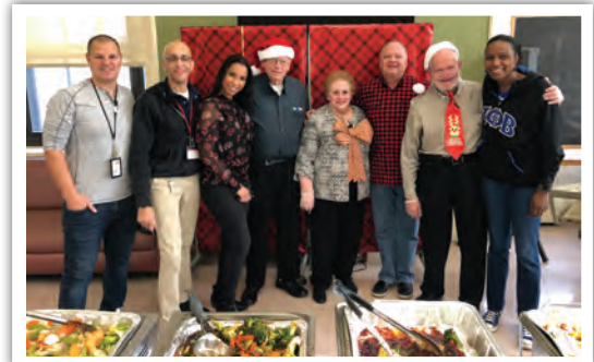
BH Staff & Generation Pharmacy

Shop on AmazonSmile Support Broadway House!!